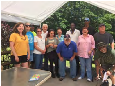
Our Veterans enjoy a wonderful Bar B Que and generous donation from the Saratoga Wilton Elks