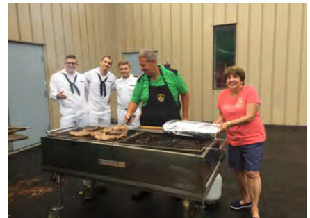
The Knights of Columbus prepare a Surf & Turf dinner served to our Veterans by the US Navy volunteers