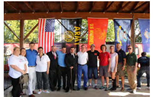
VCHC staff with Saratoga Chamber's Veterans Business Council celebrate the donation of a car to one of our Veterans by H&V Collision and Geico