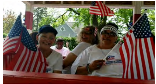
Did you see us in the parades this past summer? The veterans & staff of VCHC worked together on building a replica of our logo for a parade float. Special Thanks to Brownell Construction for their guidance and help in building the float.