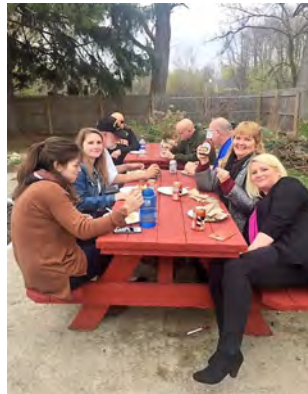
Staff of VCHC, board members, veterans, and community members all came together for the Veterans Cook Off BBQ, it was delicious.