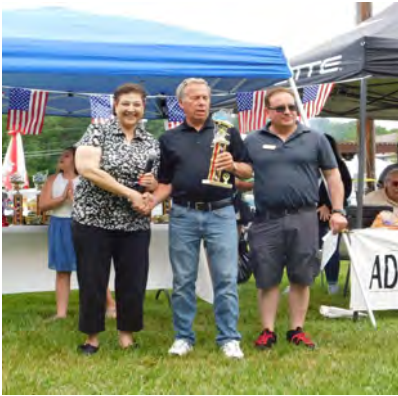
Adirondack Corvettes Club 3rd Annual Vettes for Vets fundraiser.