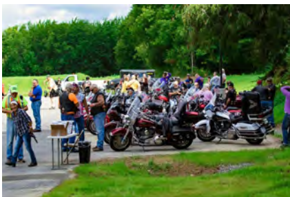
Galway Lions Club and Galway Fire Dept. hosts "Roar on the Road" to support our Veterans